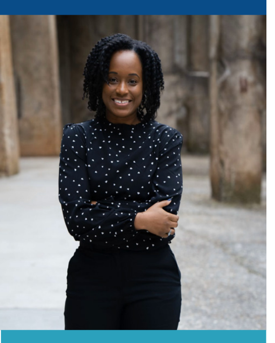
Markela combines her expertise in play therapy with storytelling to support children and families on their emotional journeys.